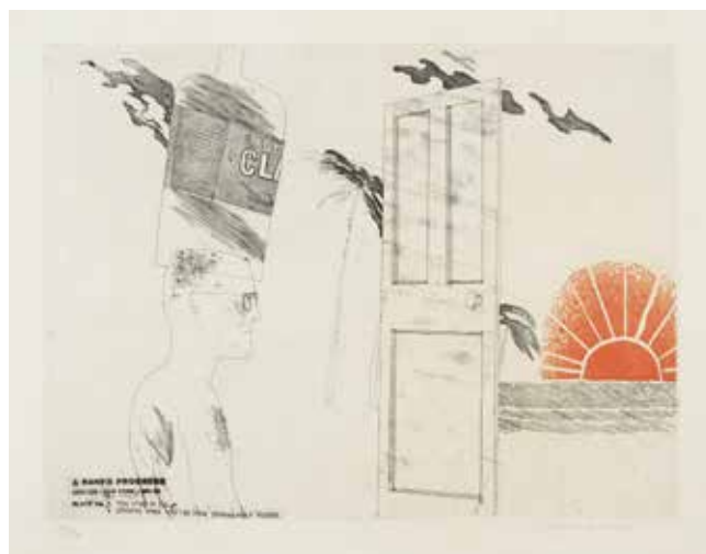
David Hockney: The Rake's Progress, Plate 3: The start of the spending spree and the door opening for a blond 1961-1963, Etching and aquatint on paper, The Whitworth Art Gallery, The University of Manchester