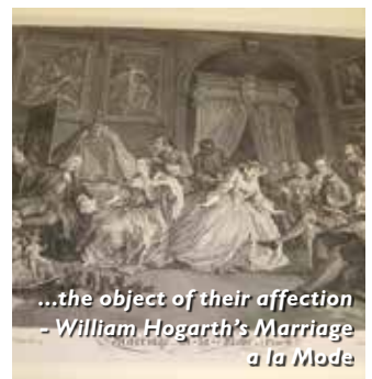
...the object of their affection - William Hogarth's Marriage a la Mode