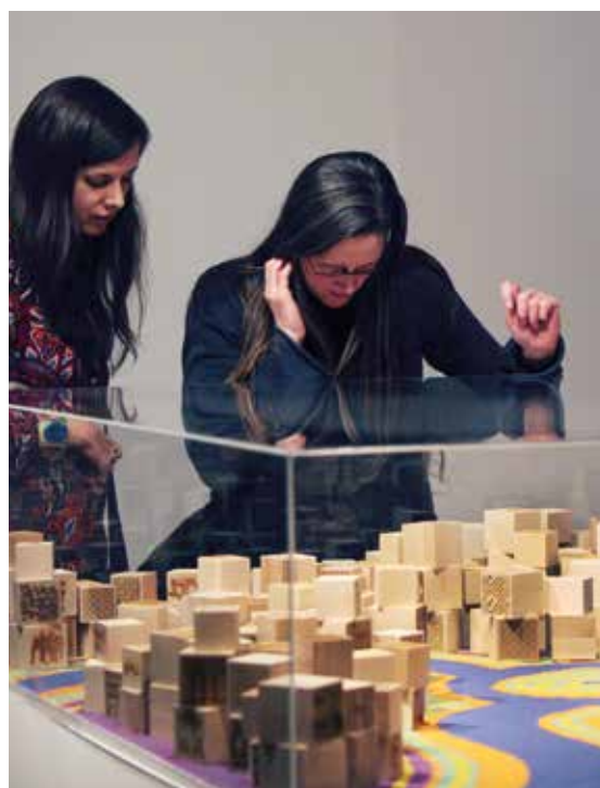
COTTON: Global Threads, Whitworth Art Gallery, 2012.