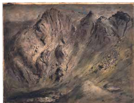
John Piper: The Slopes of Glyder Fawr, Llyn Idwal, Caernarvonshire, Wales 1947 Pen and ink, watercolour and bodycolour on paper, The Whitworth Art Gallery, The University of Manchester

John Piper: The Mountains of Wales, Paintings and Drawings from a Private Collection – December 12, 2012- March 2013.